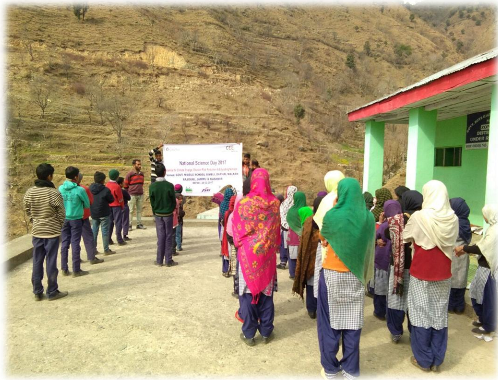
Celebration at Government Middle School, Simbli, Darhal, Malkan, Rajouri, J&K

Supported by: Give2Asia, JSW Foundation, RCE Srinagar, Mountain Partnership, IHCAP