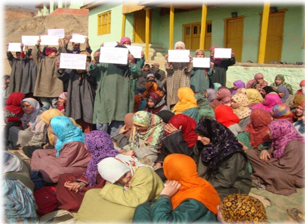
Students showing their drawings