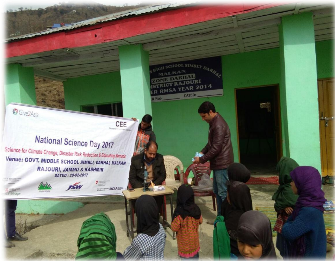
Celebration at Government Middle School, Simbli, Darhal, Malkan, Rajouri, J&K

Rajouri, Jammu and Kashmir: Another event marking the National Science Day was organized at Government Middle School, Simbli Darhal, District, Rajouri, J&K with a participation of 35 students. Since Rajouri falls in seismic zone 4 it is necessary for schools students, their families and the community to learn about climate change and disaster mitigation. Therefore, CEE Himalaya organized various activities- lectures, debates, games to make students and teachers learn about disasters, dos and don'ts during disasters, school safety, emergency services etc. In addition students were involved in mini-science experiments to learn more about basic concepts of science to understand climate change, environment and disasters more closely. The principal of the school expressed immense gratitude towards the organization for conducting such joyful learning activities for students and invited CEE Himalaya conduct more such programmes in the entire area.