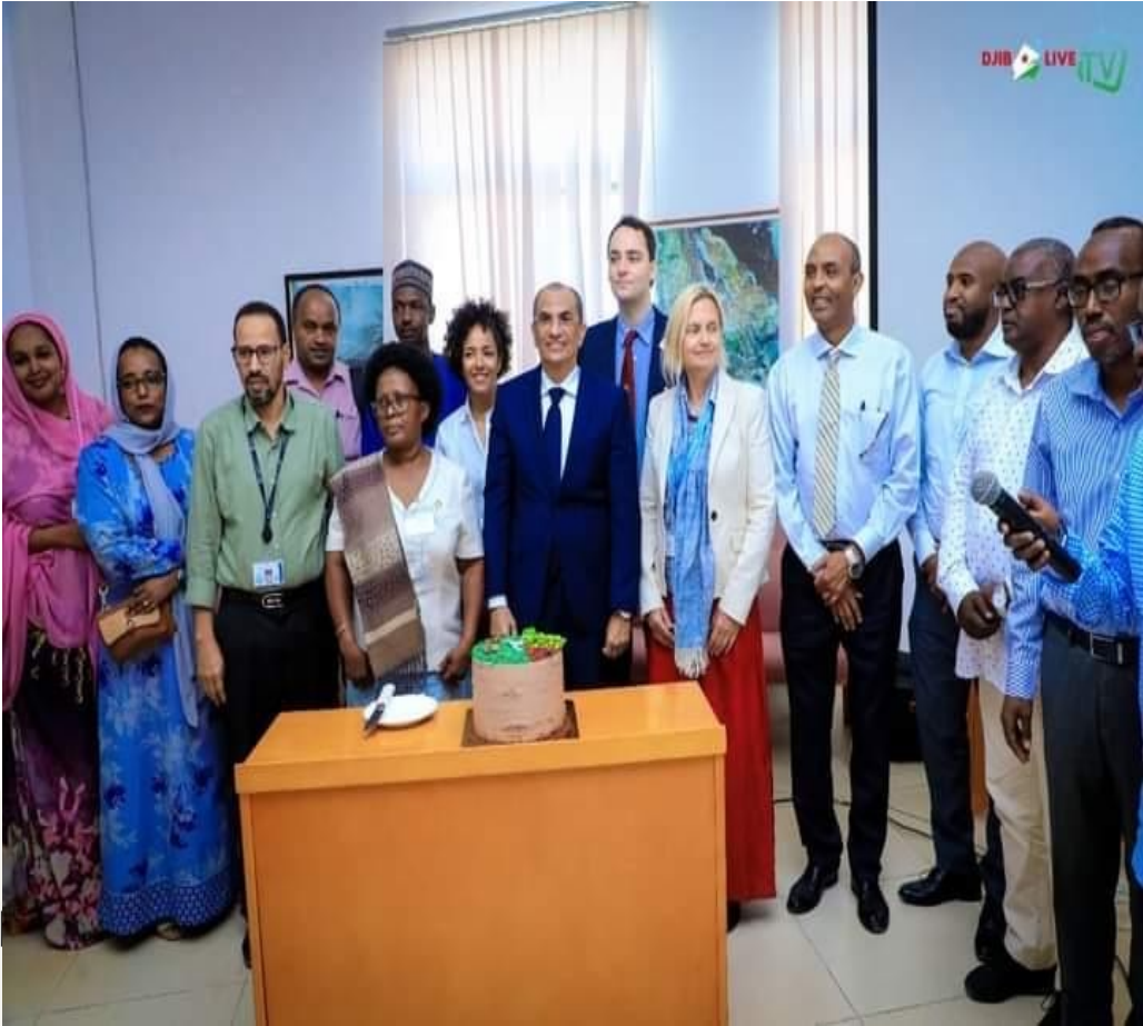
5 th Meeting of the Regional