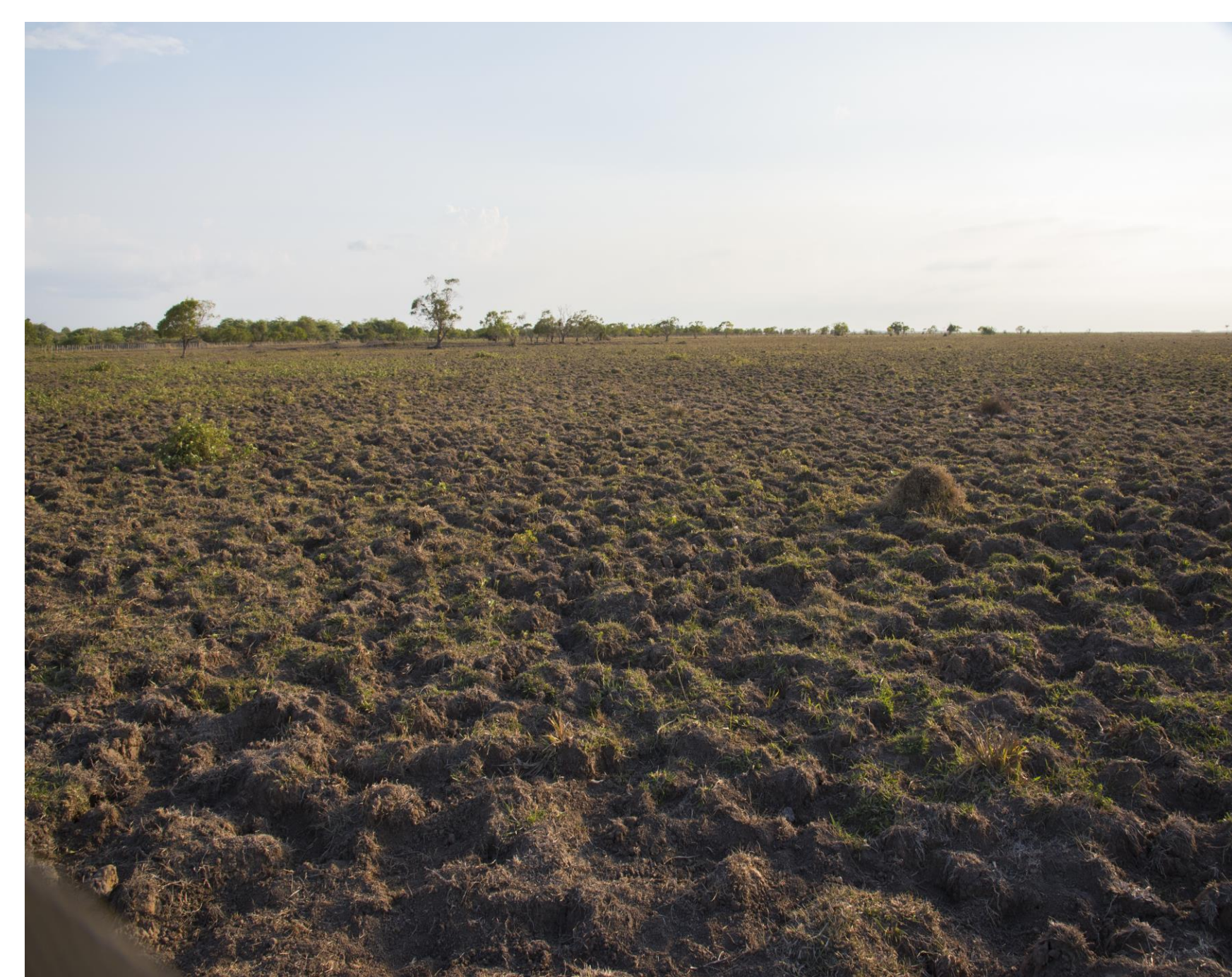
Fig 2. Solonetz in Floodplain fields (Campo de Perizes) - Vitória do Mearim, Maranhão, Brazil.

AW: Available water calculated by subtracting the water content at the potential of 6, 10 and 33kPa from the water content at 1500 kPa.