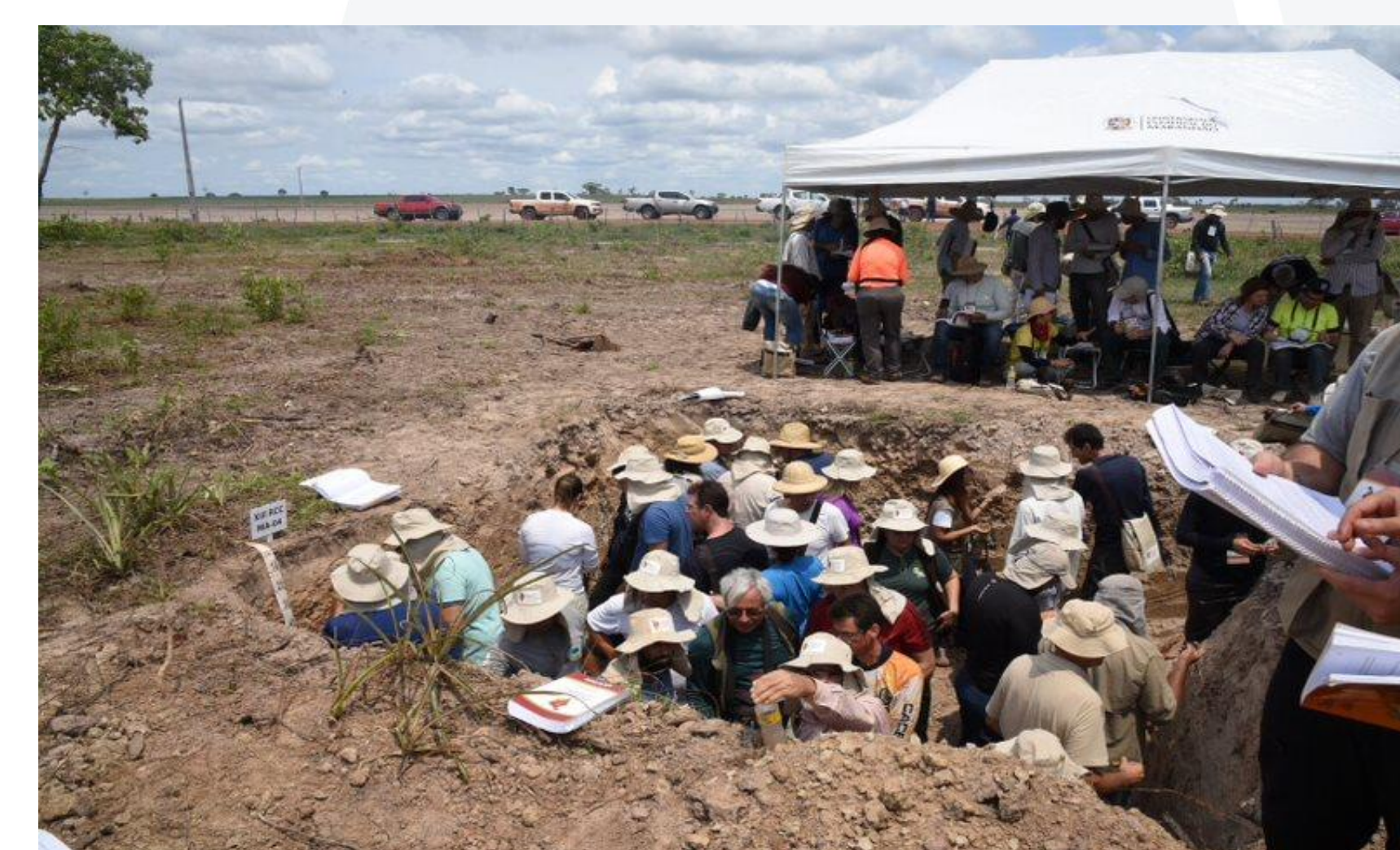
Fig 4. Participants of the Soil Correlation and Classification Meeting - XIII RCC- Maranhão, Brazil.

To the participants of the XIII RCC MA and to UEMA, EMBRAPA, SBSC, CNPq.