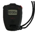
Agogo na duba lokaci