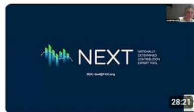
"4 per 1000" Initiative Community of Practice: Nationally Determined Contributi...