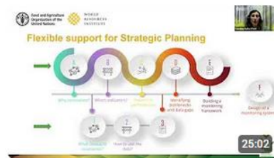
"4 per 1000" Initiative Community of Practice: Assessment, Understanding and...