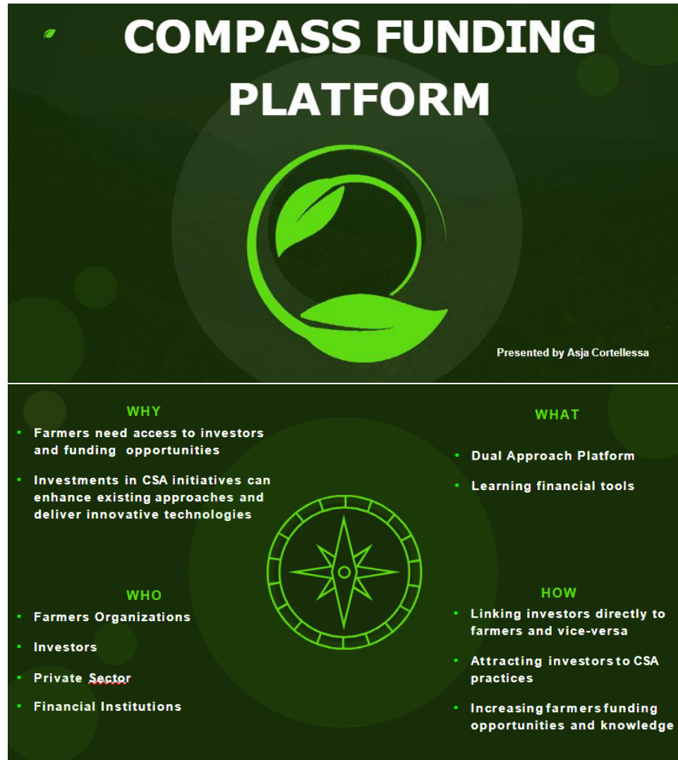
Annex 3 – Shark Tank Approach