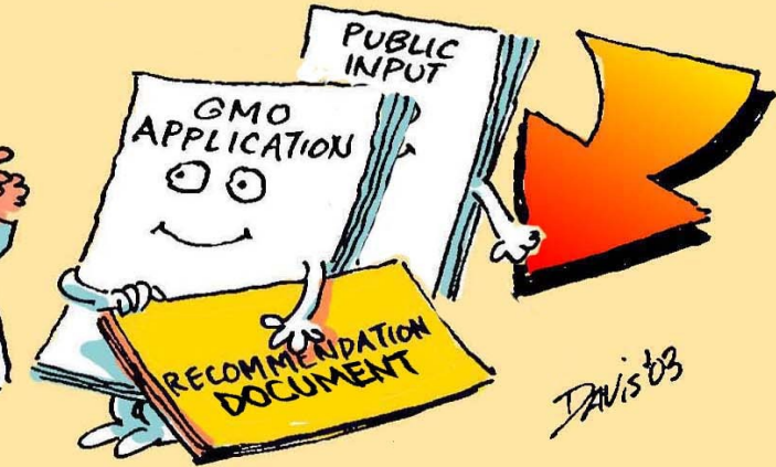
A RECOMMENDATION DOCUMENT IS PREPARED BY THE ADVISORY COMMITTEE