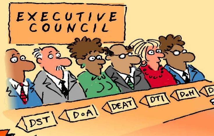
THE EXECUTIVE COUNCIL EVALUATES THE APPLICATION, TAKING INTO CONSIDERATION THE RECOMMENDATION FROM THE ADVISORY COMMITTEE AND PUBLIC INPUT