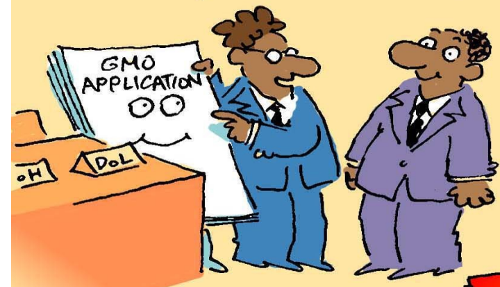
THE GMO REGISTRAR IS INFORMED OF THE DECISION OF THE EXECUTIVE COUNCIL AND IMPLEMENTS IT