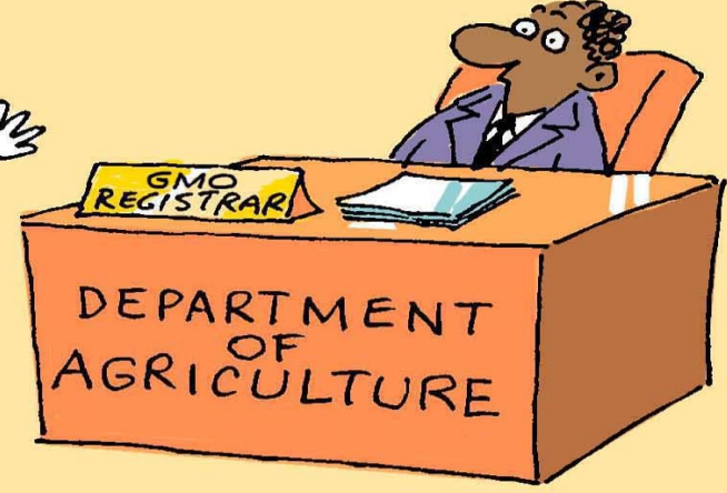
THE GMO APPLICATION IS SENT TO THE REGISTRAR FOR GMO'S AT THE DEPARTMENT OF AGRICULTURE