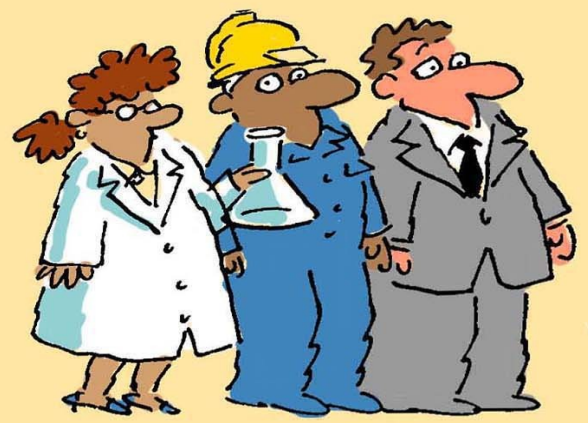
INTERESTED PARTIES FILL OUT AN APPLICATION TO DEVELOP GMO'S