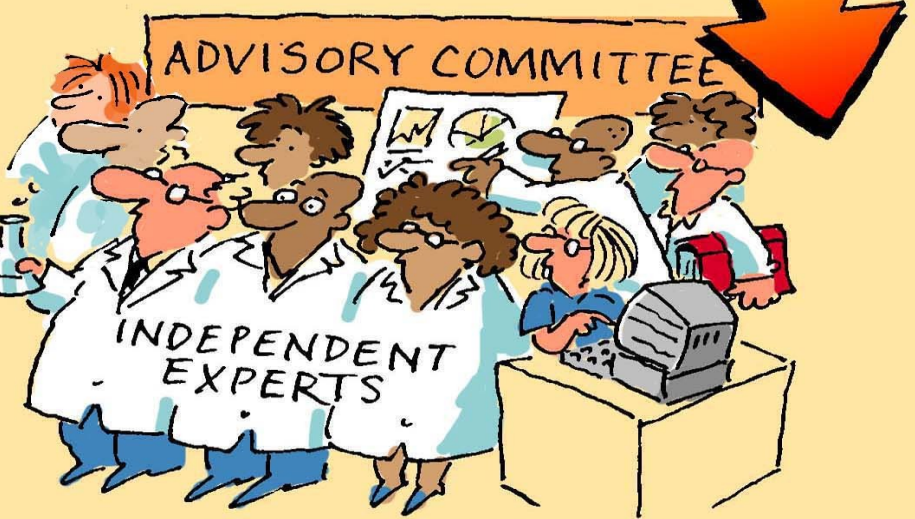
THE APPLICATION IS EVALUATED BY THE ADVISORY COMMITTEE. ADDITIONAL INFORMATION MAY BE REQUESTED FROM THE APPLICANT