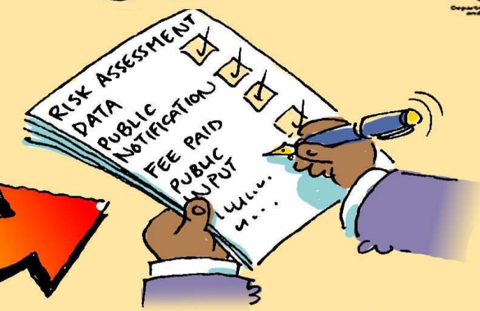
THE REGISTRAR CHECKS TO SEE IF THE APPLICATION MEETS THE REQUIREMENTS OF THE GMO ACT