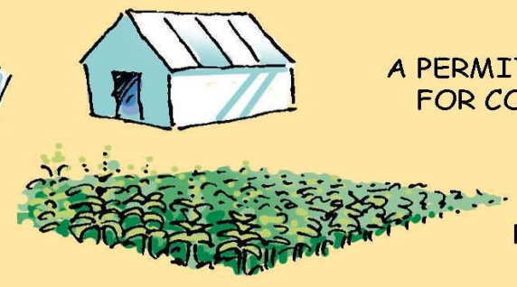
A PERMIT MAY BE ISSUED FOR CONTAINED USE...