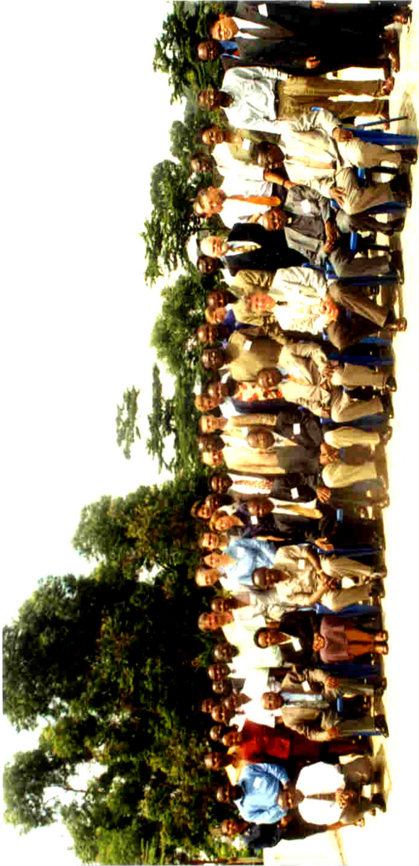
Participants of the Second National Workshop on Policies for Improved Land Management in Uganda, April 17-19, 2002