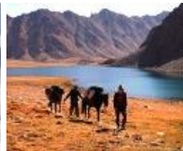
Nomination opens for Mountain Protection Award

On 4 March 2015, Albertine Rift Conservation Society (ARCOS), United Nations Environment Programme (UNEP) and Partners released two landmark publications to guide the sustainable mountain development (SMD) agenda in Africa