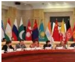
Twelve countries discuss snow leopards

The Global Snow Leopard and Ecosystem Protection Program (GSLEP) held its first Steering Committee meeting on 19–20 March 2015 in Bishkek, the capital of Kyrgyzstan. Hosted by the State Agency of Environmental Protection and Forestry of the