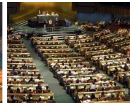
Call for submissions for the UNSG report