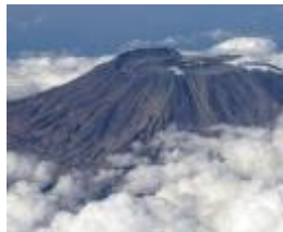
Two new books on African mountain development

The Global Snow Leopard and Ecosystem Protection Program (GSLEP) held its first Steering Committee meeting on 19–20 March 2015 in Bishkek, the capital of Kyrgyzstan. Hosted by the State Agency of Environmental Protection and Forestry of the