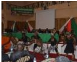
Towards a shared mountain agenda for Africa