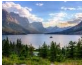
The new federation of mountain protected areas