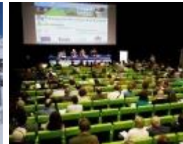
The future of European mountain areas discussed

Mountain Research and Development is planning a Focus Issue on "Observing Mountains and Sharing Knowledge". The speed, nature, and dimension of changes in mountains pose complex challenges for mountain societies and mountain