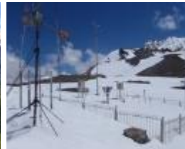
Observing mountains and sharing knowledge