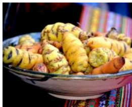
Call for mountain product case studies