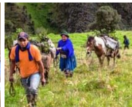
MP member wins sustainability award