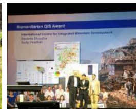
ICIMOD receives Humanitarian GIS Award