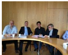
Mountain museums become interactive