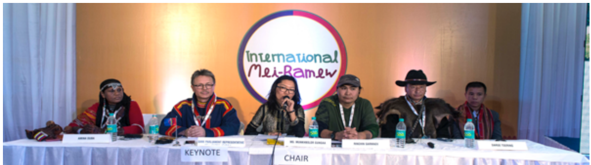
Thematic session "Pastoralists and their challenges"