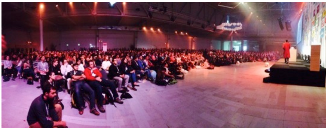
We Feed the Planet, Milano

In addition, FAO facilitated the attendance of indigenous and pastoralist youth from the seven sociocultural regions.