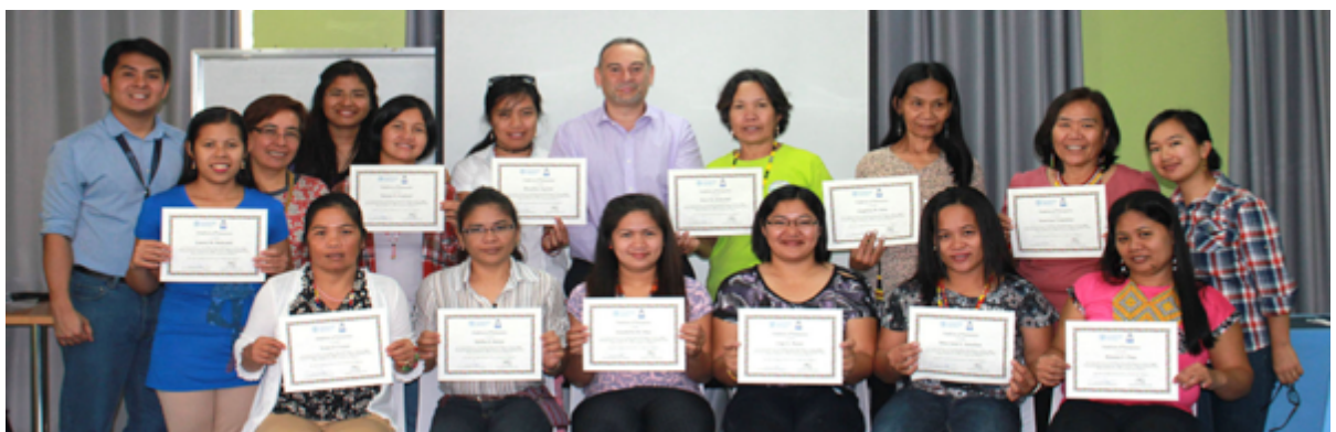
Philippines, March 2016