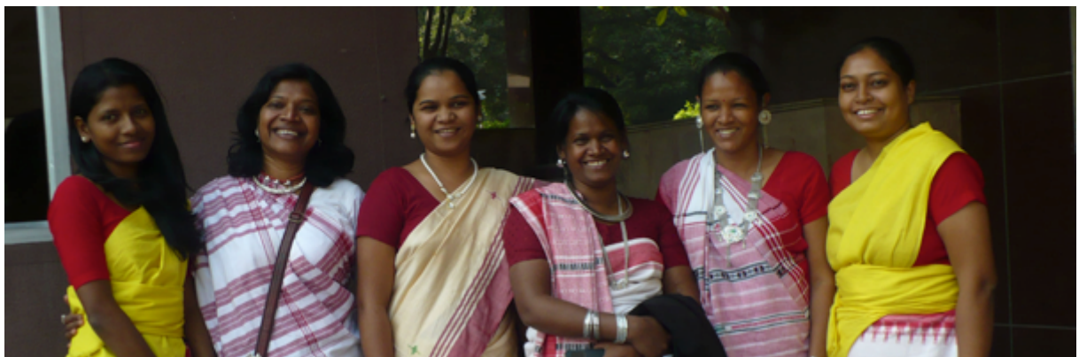
India, November 2015