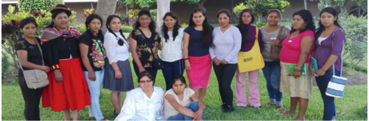
Peru, January 2016