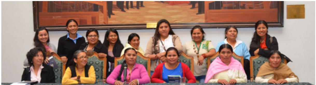
Bolivia, December 2015