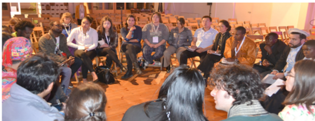
Young indigenous and pastoralist representatives meeting in We Feed the Planet, Milano