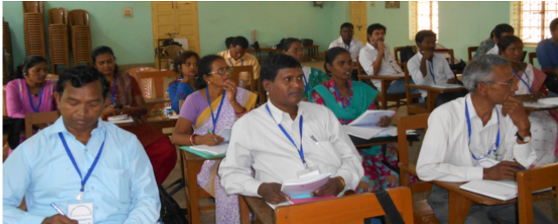
Subregional workshop in Assam with participants from Nagaland, Arunachal Pradesh, Meghalaya, Mizoram, Tripura and Assam