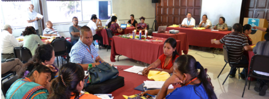
Indigenous representatives and experts during the workshop in Panama