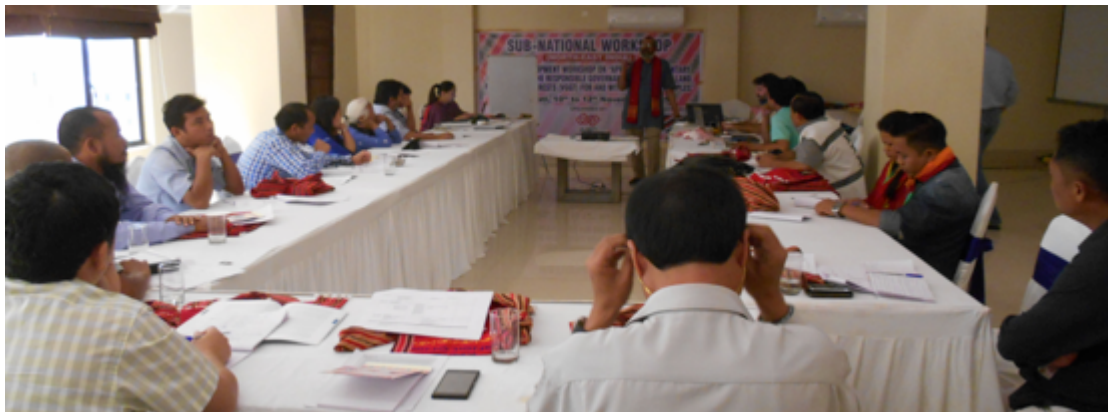
Subregional workshop in Odisha with participants from Chhattisgarh, Jharkhand, Odisha