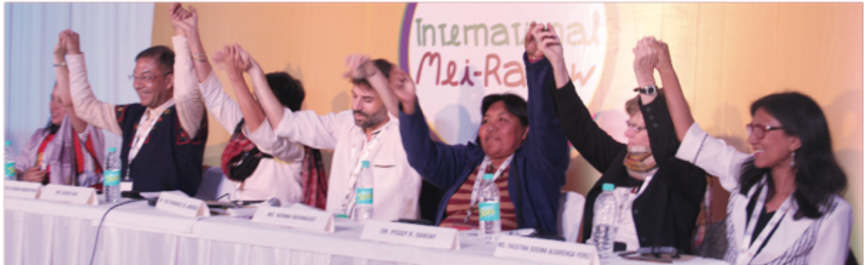
Thematic session "Women's role in the future of food and nutritional security"

FAO engaged in this event chairing two thematic sessions: "Women's role in the future of food and nutritional security" which fostered a debate centered in the governance and land stewardship mechanisms found in some matriarchal societies; and "Pastoralists and their challenges," built around the main common issues affecting pastoral communities over the world.