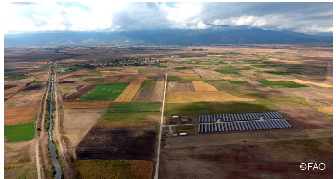
Drone image of the land consolidation area in Egri village, Bitola Municipality

The 2020 European Commission Report on North Macedonia has recognized the advanced status of land consolidation in the country. This achievement is a result of the joint efforts of FAO, the European Union, and the Ministry of Agriculture, Forestry and Water Economy. The advancement of land consolidation in North Macedonia, as recognized by the European Commission, confirms that the joint efforts of FAO, the European Union, and the Government of North Macedonia to mainstream and scale-up the National Land Consolidation Programme across the country have brought visible results. Read the full story.