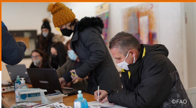
Landowners Assembly in Dabjani village

Active involvement of agricultural landowners and rural communities have remained in the focus even during the challenging circumstances caused by the Covid-19 pandemic. In line with the health and safety protocols, the MAINLAND team together with MAFWE and partner geodetic companies has visited village by village and dedicated serious efforts to listen to and address landowners' preferences/concerns regarding consolidation of their land in order to implement the package of incentives and benefits that advance individual and rural community needs. Due to delay in implementation caused by the Covid-19 pandemic, the project duration has been extended until November 2022.