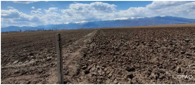
Staked out boundary of a new land parcel in Egri village

In parallel with the ongoing preparations for start of the construction works, the newly-formed land parcels in Egri were registered in the Agency for Real Estate Cadastre and the staking out of their new boundaries on the field was successfully finalized in the end of March 2021. This means that all 214 landowners in Egri will receive new ownership titles and will start the agricultural season 2021 on their newly consolidated land parcels, that allow for better and more efficient farming practices.