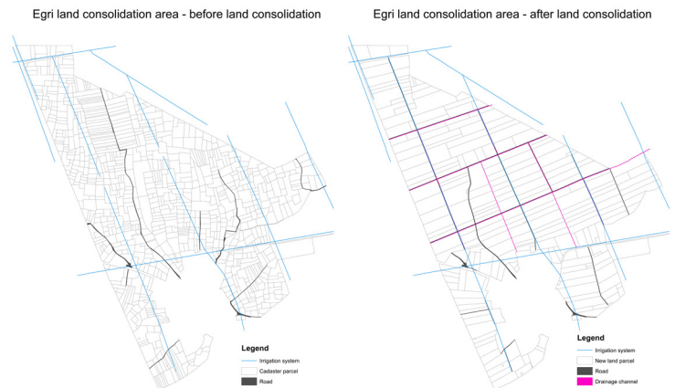
Map of Egri – before and after land consolidation click HERE for larger view

The village of Egri, Bitola Municipality, became the first majority-based land consolidation project in North Macedonia, after the land re-allotment plan was adopted by the qualified majority of landowners in January 2020 ( PHOTO ALBUM ). With land consolidation, the number of land parcels in Egri was reduced by almost fourfold, from 874 parcels to 260. The 214 landowners now have bigger, regularly-shaped parcels that allow for better farming practices. The average parcel size is now 1.30 ha, compared to only 0.38 ha average before land consolidation. Land consolidation in Egri also includes investments in agricultural infrastructure improvements, expected to be finalized by the end of 2021. These include construction of drainage channels, extension of the existing irrigation network and construction of gravel roads in the village of Egri, funded by the MAINLAND project.