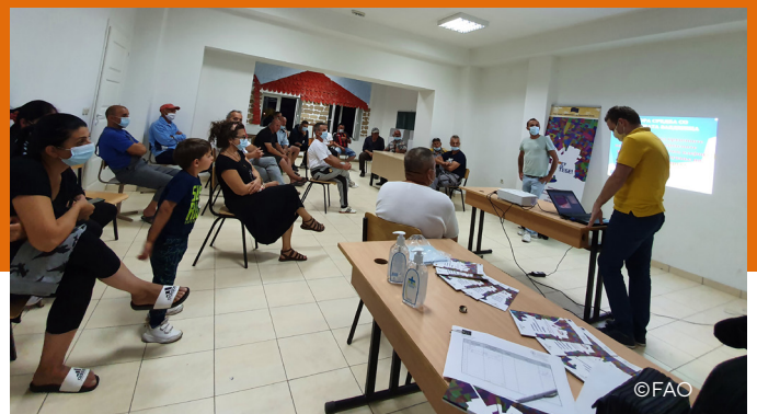
Community meeting in Leshani village