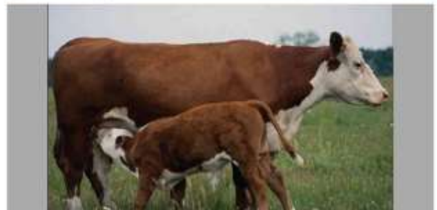
Regional workshop on lumpy skin disease prevention, control, and awareness

Източник: | Преглед: 2429 | Коментари: (0)