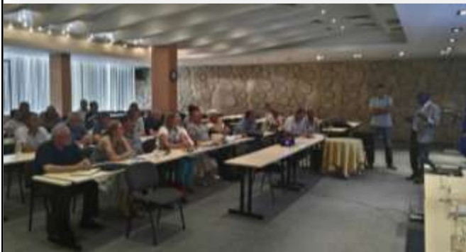
Training on vaccination, sharing experience with South Africa, Sofia, July 2016

Organizing and hosting events - trainings