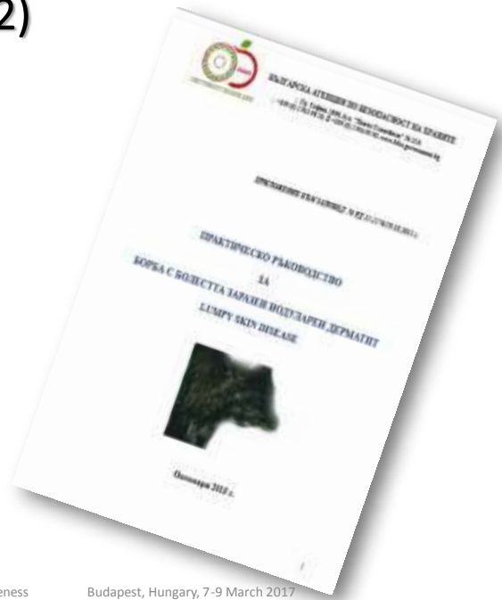
Regional workshop on lumpy skin disease prevention, control, and awareness