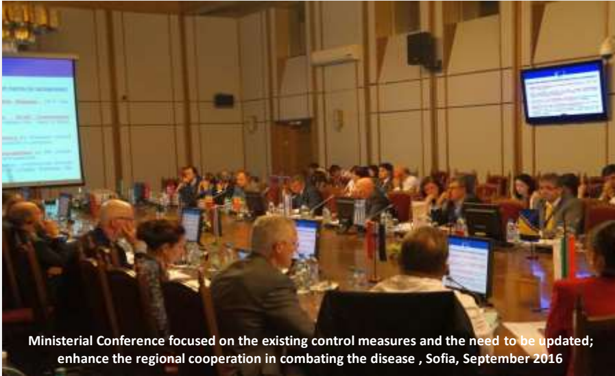
Ministerial Conference focused on the existing control measures and the need to be updated; enhance the regional cooperation in combating the disease , Sofia, September 2016

Organizing and hosting events – meetings between high-ranking representatives