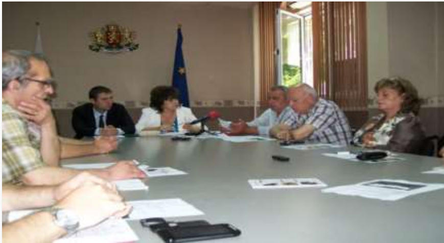
Raising awareness in policy makers at local level (major and its devoted staff) -influence them , to cooperate the VSs in controlling the disease, Sofia, May 2016

Organizing events – meetings held with local high-ranking representatives