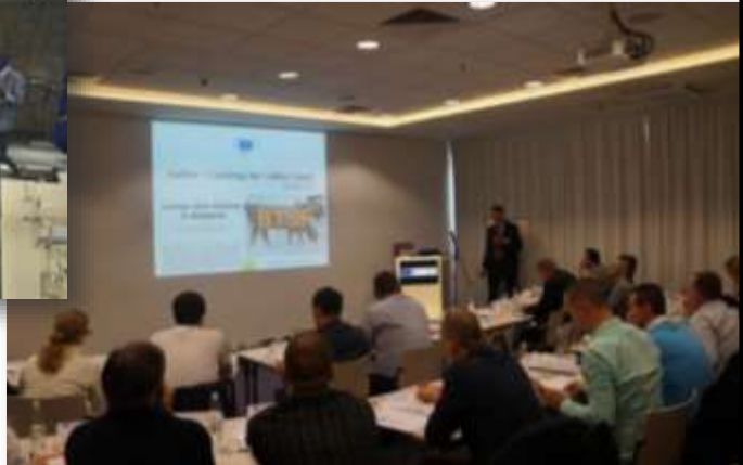
Training (BTSF) - improving knowledge and sharing experience, Sofia, Nov.2016