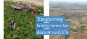
Number of farms by size and ha of UAA