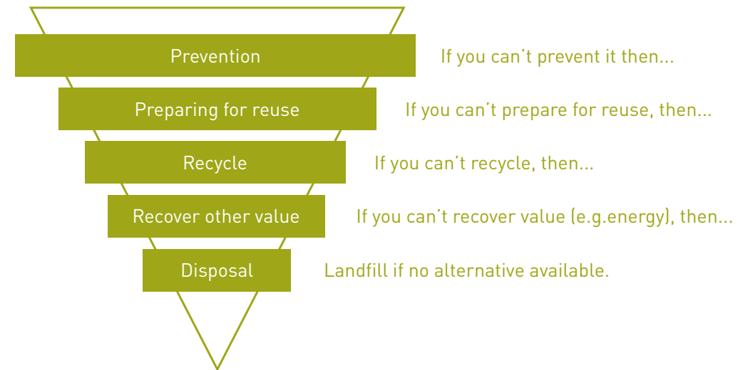
Figure 2: The waste hierarchy

The practices on the following pages are designed to prevent waste in the supply chain from sea to plate.